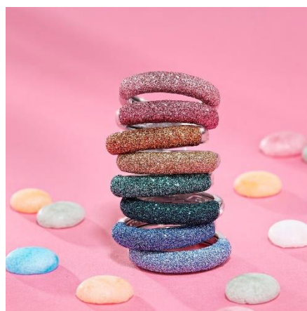
Polvere di Sogni – Colors of the World