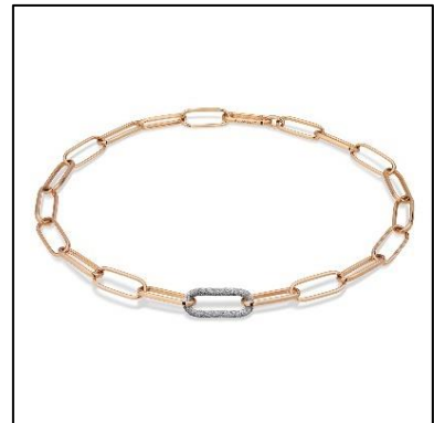
Forever Chic Gold