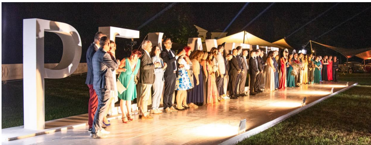
The Pesavento team