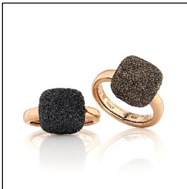
Polvere di Sogni