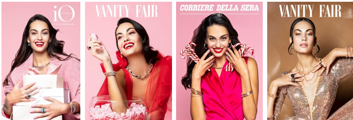
The Pesavento "Sweet Christmas" 2023 campaign: 4 ad subjects, 9 print ads

Pesavento's campaigns engage the audience through social platforms like Instagram and Facebook, achieving significant interactions, visits, and shares.