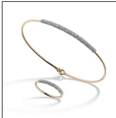
Dna Spring Gold