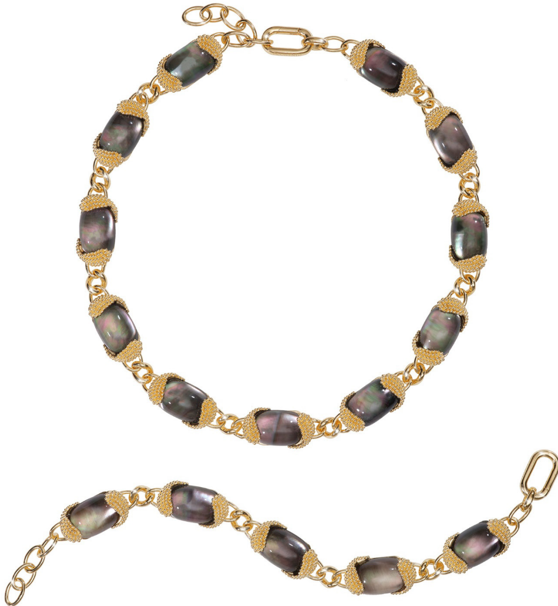
Pesavento Luxury choker and bracelet in yellow silver with rock crystal and mother-of-pearl gemstones.