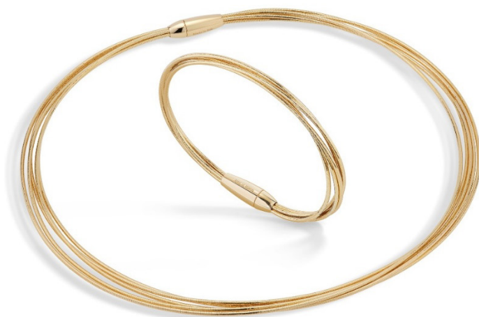
DNA Spring silver necklace and bracelet in a golden yellow shade.