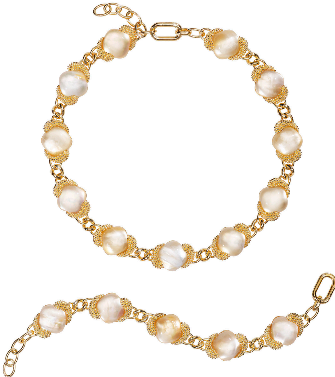
Pesavento Luxury choker and bracelet in yellow silver with rock crystal and mother-of-pearl gemstones.