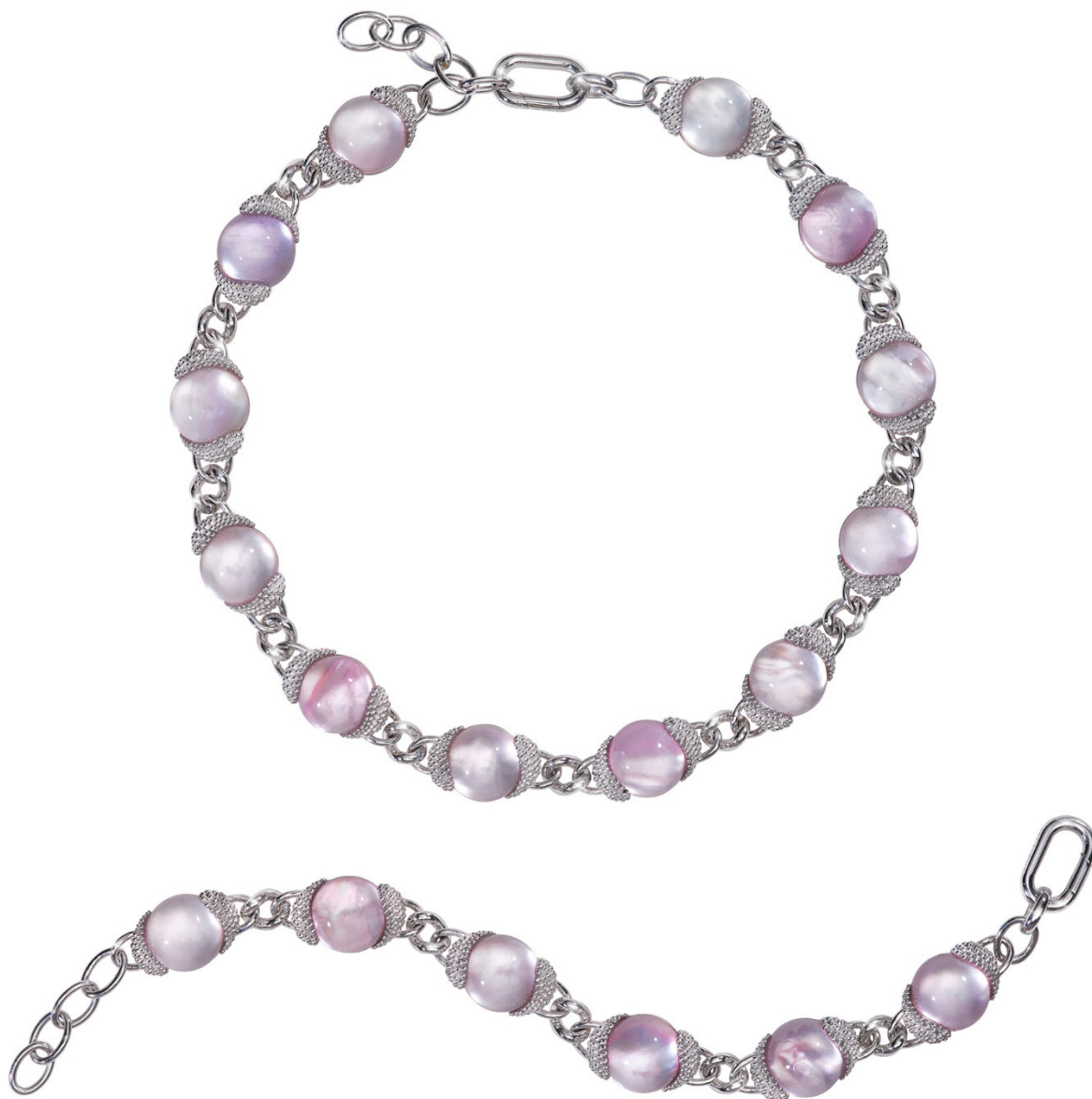
Pesavento Luxury choker and bracelet in white silver with rock crystal and mother-of-pearl gemstones.