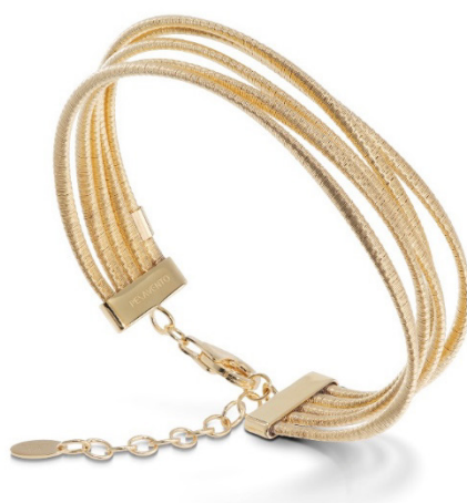
DNA Silk bracelet in silver, in a golden yellow shade.