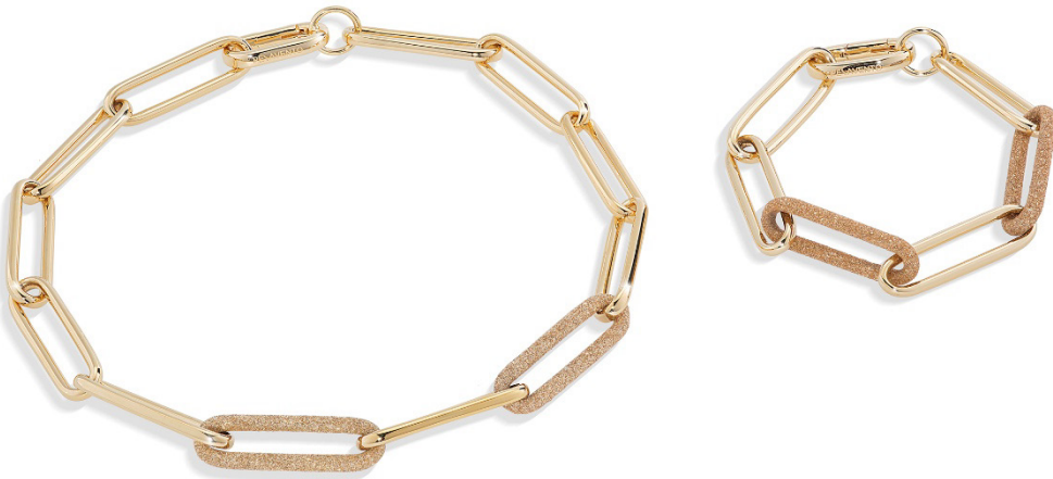
Polvere di Sogni necklace and bracelet with yellow gold finish and elements covered in Polvere di Sogni in luminous Nardò Yellow.

Amazing and evocative shapes! In the new Polvere di Sogni designs, the highly original chokers and bracelets feature chains with huge, bright links and elements coated in Polvere di Sogni, creating wonderful golden flashes that highlight the allure of every woman.