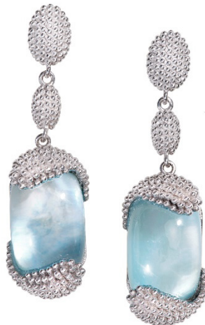
Pesavento Luxury earrings in white silver with central rock crystal and mother-of-pearl gemstone.

The heart of the Pesavento Luxury collection is the gems, brought back to center stage in a symphony of light and splendor. Large, shiny and eye-catching rock crystal and mother-of-pearl cabochons sparkle with shades of blue, pink, yellow and brown, creating necklaces, earrings, bracelets and rings of true brilliance. They range in shape from oval to round and oblong to square. They are enclosed in soft frames with white or yellow silver Pixel microbeads that sparkle with an infinite glow, creating a material and chromatic contrast that enhances each individual piece of jewelry.