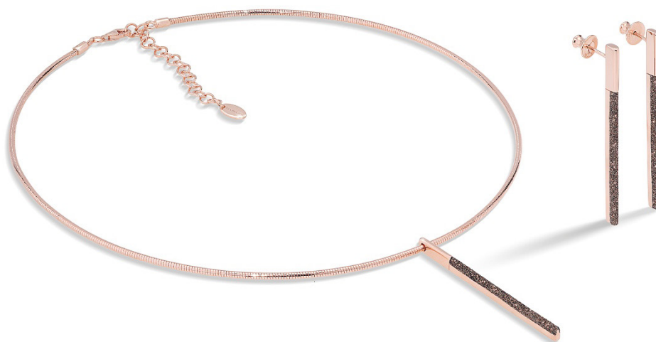
DNA & Polvere di Sogni necklace and earrings in rose silver with black or bronze Polvere di Sogni dust.

Each piece is an example of glamorous flair, attracting the eye by its striking contrasts: the sinuous brilliance of DNA Spring thread and the sparkling light of Polvere di Sogni, the warm tones of rose silver and bright flashes from the black or bronze Polvere di Sogni dust. A contemporary collection, which gives real character to style.